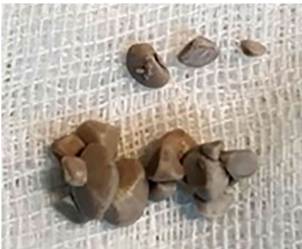
Figure 2. Crystallographic analysis result reported as struvite stones.

The removal of stones within the main urethral lumen through cystoscopy with forceps or laser ablation has been demonstrated in the literature. [11,12] To prevent recurrence and remove stones within the diverticulum, it is necessary